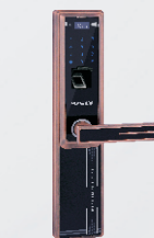
918HB-63-F Dark Copper