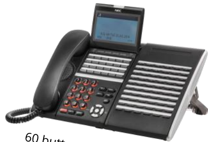
60 button console add-on

Note: Add-on modules are only available on select handset models. Not all modules are immediately available for sale