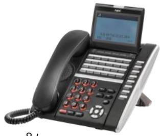
8 button add-on

Sometimes 24 buttons are just not enough - NEC has both an 8 and 60 button add-on module to ensure the features you need are simply a button press away.