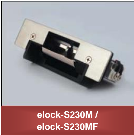
eLock-S230M / eLock-S230MF