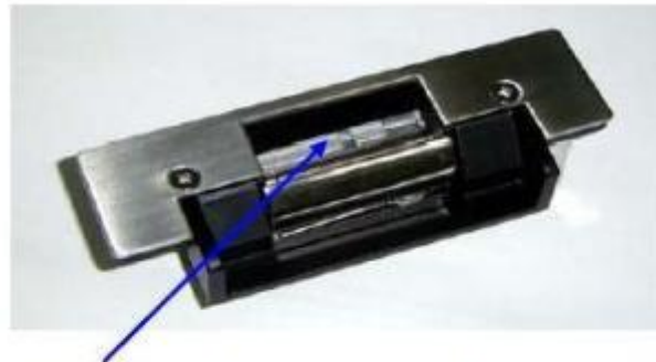
Door Status Signal ( Micro Switch )