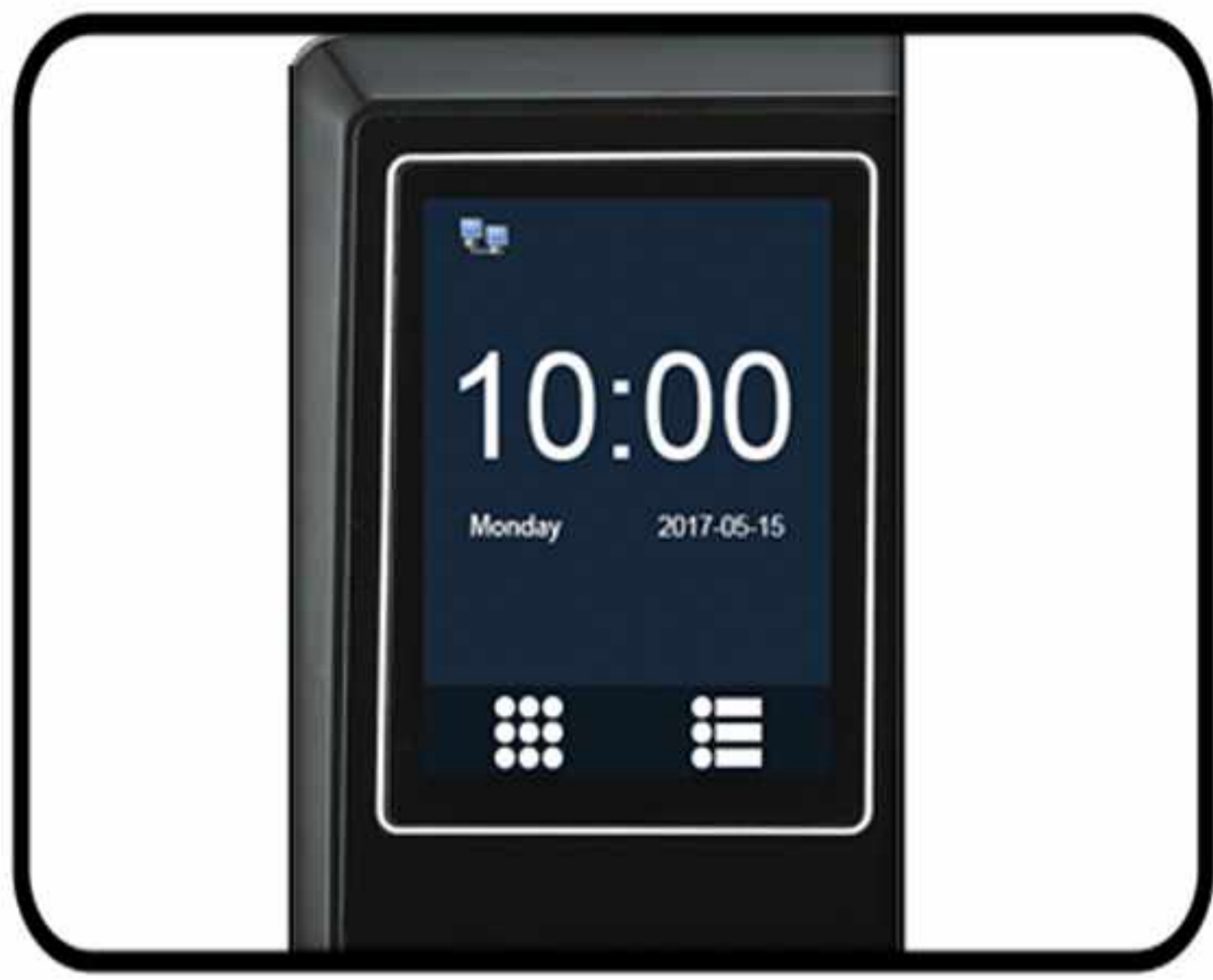
4.3 Inches Touch Screen