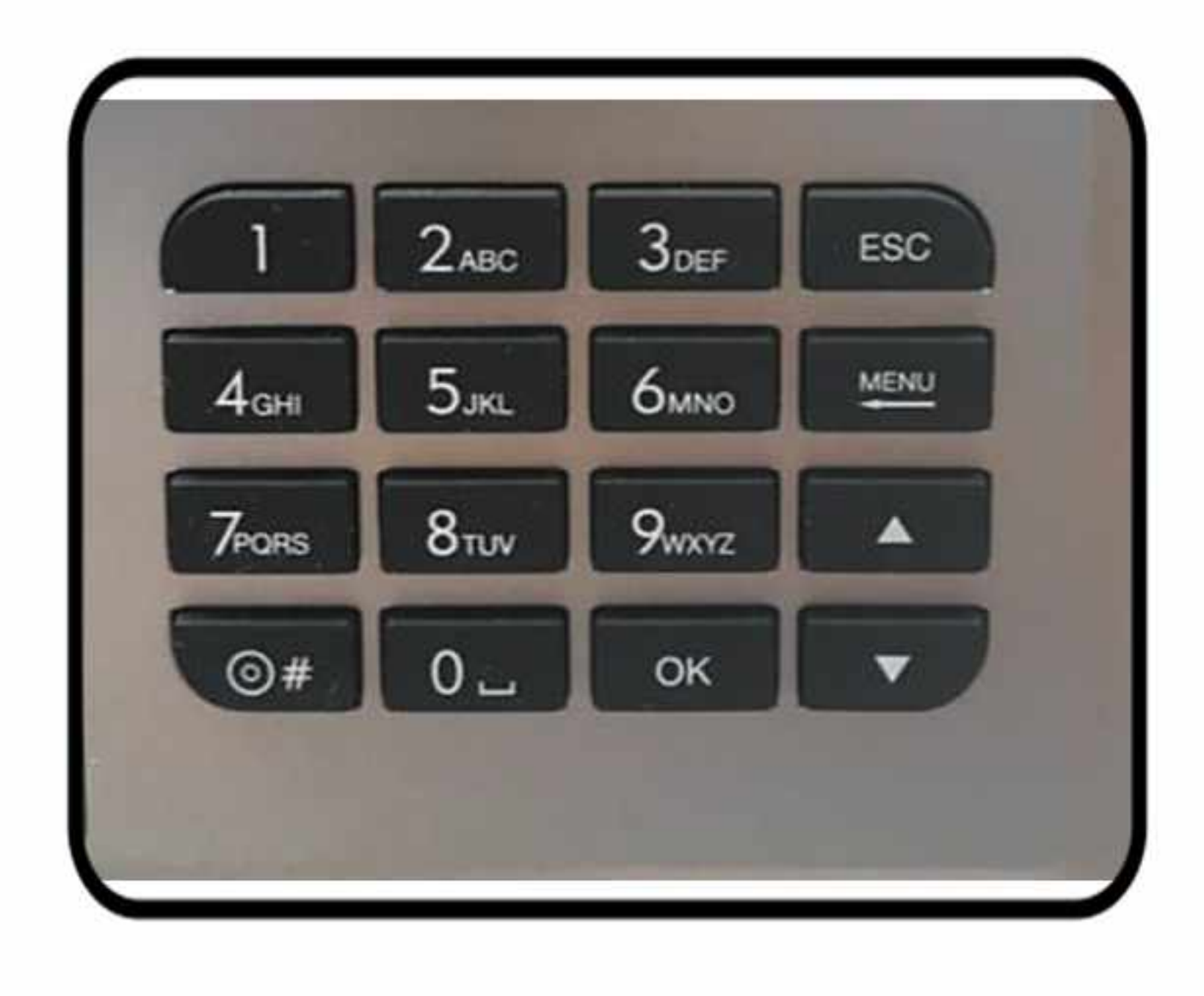
T9 Input Method Keyboard