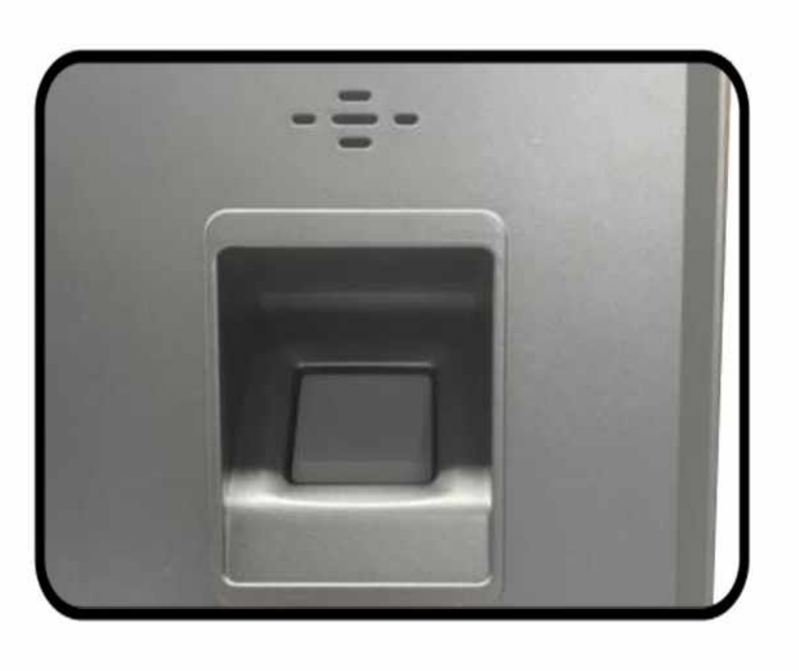
High Powered DSP Chip Finger Sensor