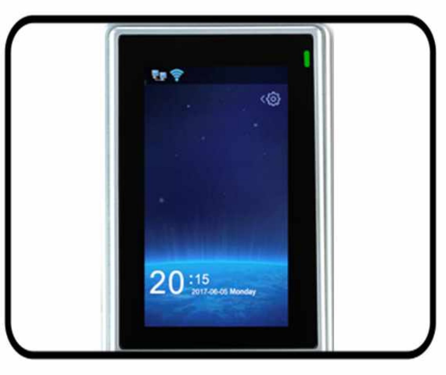
4.3 Inches Touch Screen