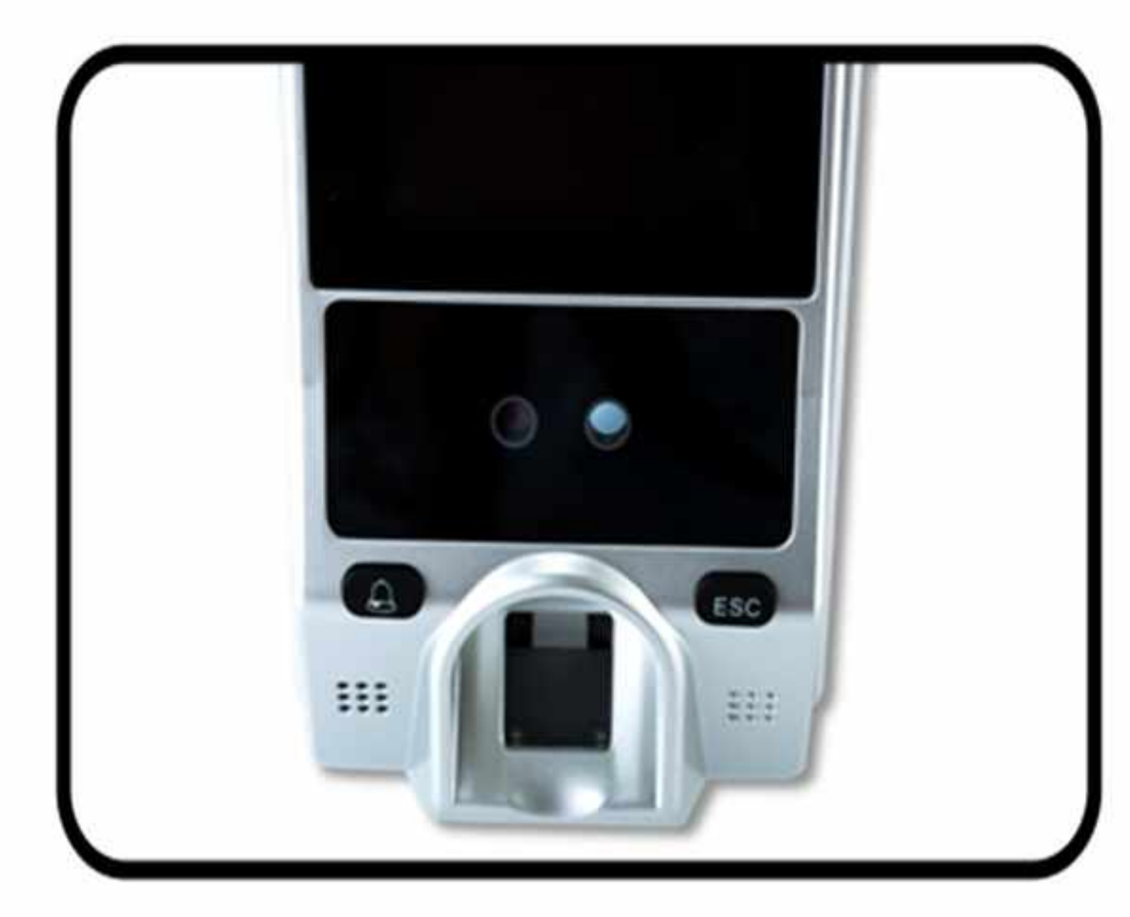
Palm, Face & Fingerprint Sensor